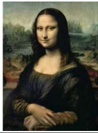
Uploaded photo, bust-shot

If for example you upload a bust-shot photo, this is what you will get.